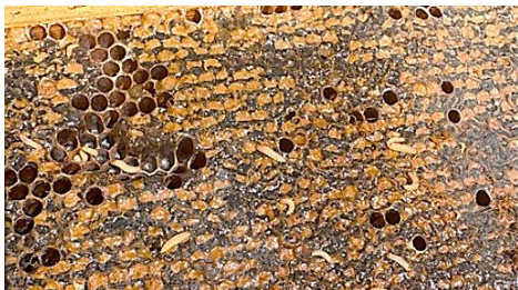
Small Hive Beetle Larva on the surface of capped honey.