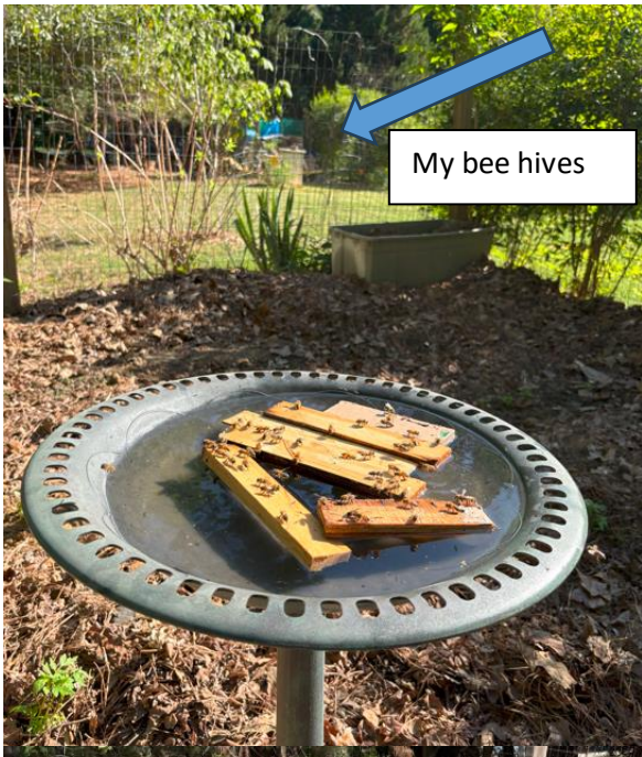
My bee hives