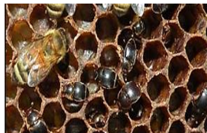
Adult Small Hive Beetles

If you are asking what you are seeing here, let me say, one must be on the look-out for these little worms and bugs ready to 'slime out' your hive.