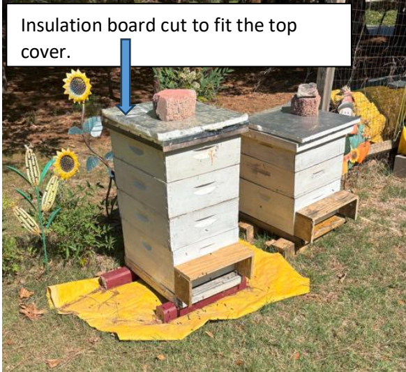
Insulation board cut to fit the top cover.

I like cheap solutions to help my bees a bit in hot weather. Nothing fancy – scrap wood and some insulating paneling do a good job of providing shade at the hive entrance. I often use old pallets as hive stands and lumber is salvaged from time to time.